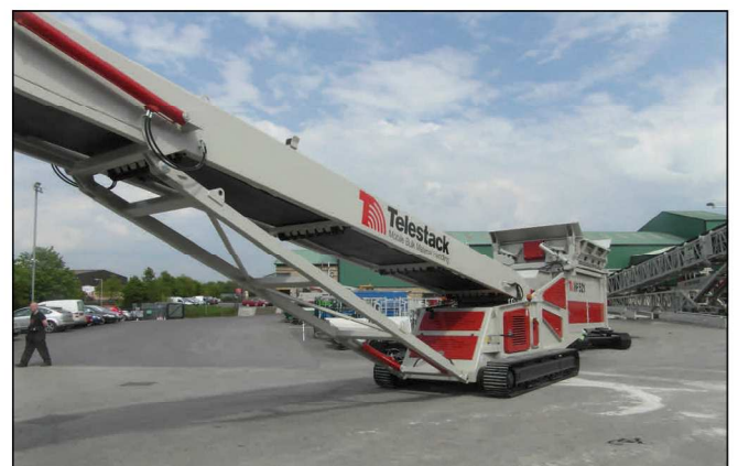
Heavy duty - 21 metre (70ft) Incline conveyor