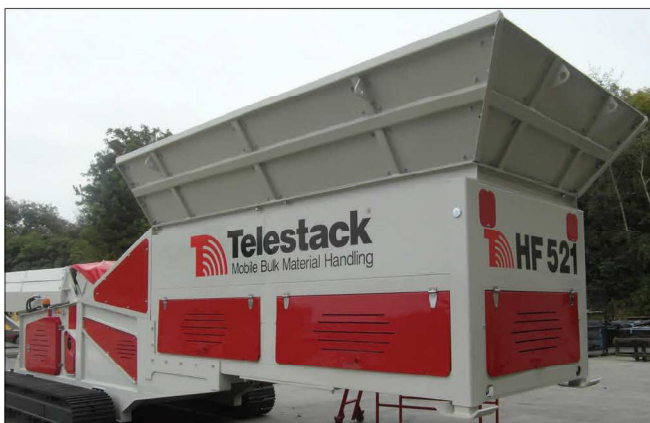
7m 3 Hopper - Optional Hopper Extensions