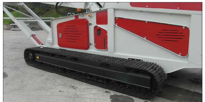
4.0 metre (12ft) - 400 Shoe Tracks