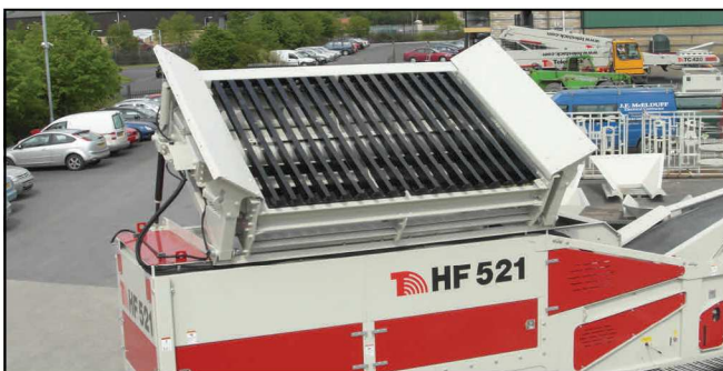
Double Deck Vibrating Grid – Remote control Start/ Stop/ Raise/ Lower